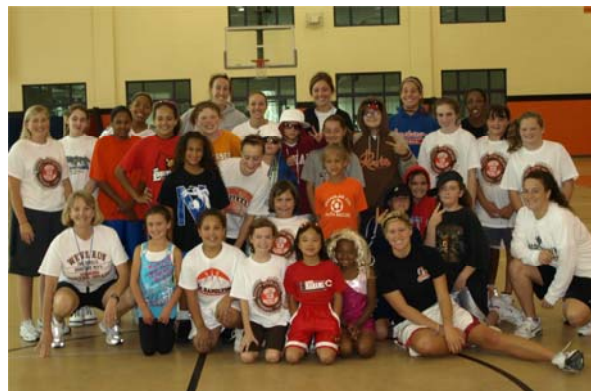
Coaches, players, and campers pause for a photo between morning and afternoon sessions at day camp!